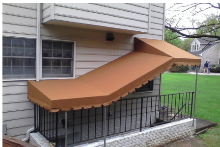
Fabric Stairwell Awning