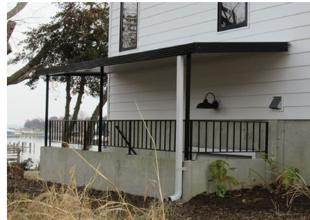
Flat Pan Stairwell Awning

No more snow shoveling, or removing leaves in tight stairway entrances. No more dangerous ice on your steps and stairways. Our basement solutions can come in metal, vinyl or fabric.