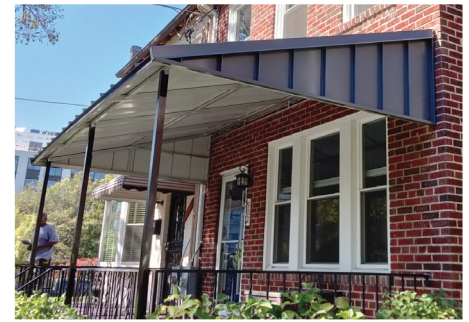
Standing Seam Awning