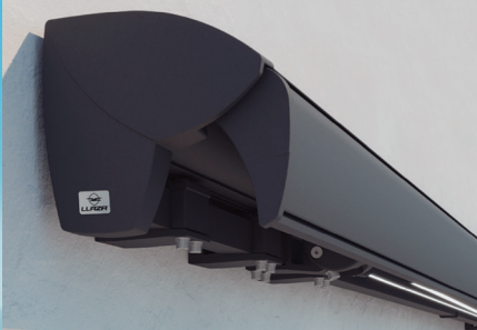
Contemporary Flat Front Bar No Valance Required