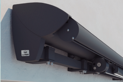
Traditional Round Front Bar Valance can be added.