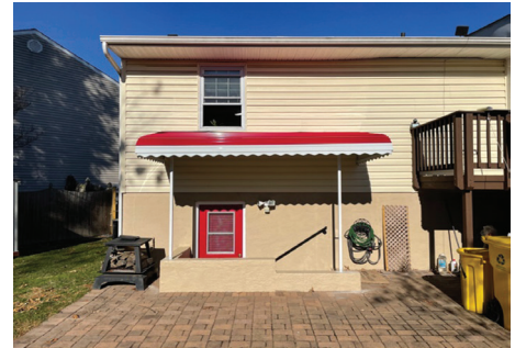
Aluminum Stairwell Awning