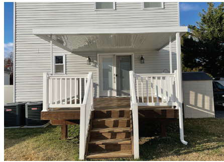
Flat Pan Awning