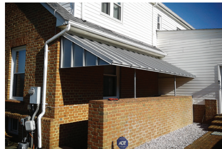
Standing Seam Stairwell Awning